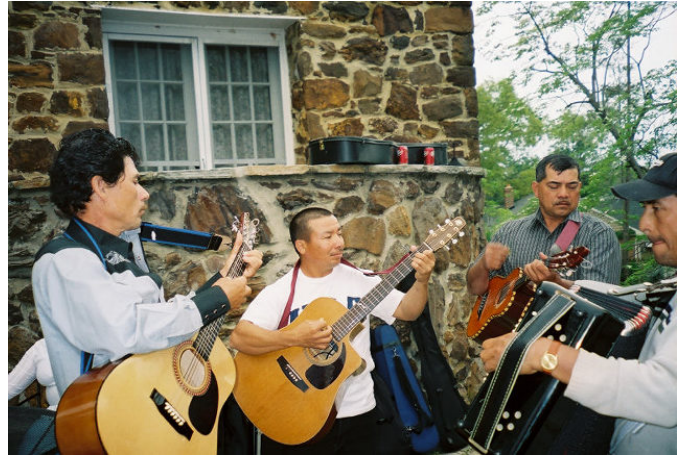
Los Muchachos de Guatemala Band