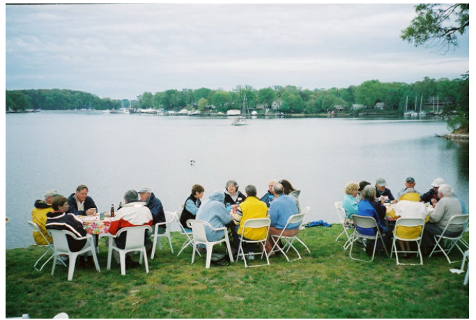
A Little Chilly, but What a View