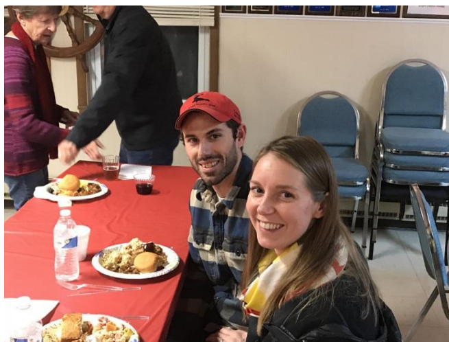
MRSA members share good food and camaraderie.